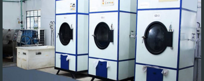
WASHES / TREATMENTS