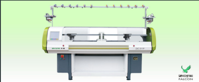
RIB COLLAR FLAT KNITTING MACHINE